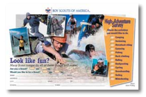
High-Adventure Survey, No. 34241. Available from your local council service center.