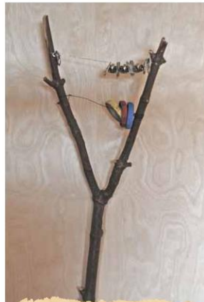
TREE BRANCH SISTRUM WITH BOTTLE CAPS, JINGLE BELLS AND POP TOP TABS AS BANGLES.

CHECK OUT MORE WORLD MUSIC FUN WITH DARIA AT WWW.DARIAMUSIC.COM